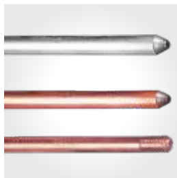
10 Galvanized steel ground rods (stainless steel rods are also available) Copper bonded steel ground rods Copper bonded steel sectional ground rods