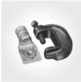
1 I-beam ground clamp connectors