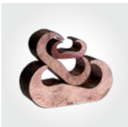
9 C-tap grid tap connectors