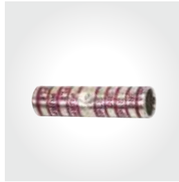
2* Two-way splice connectors