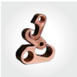
7 Figure 6 compression ground tap connectors