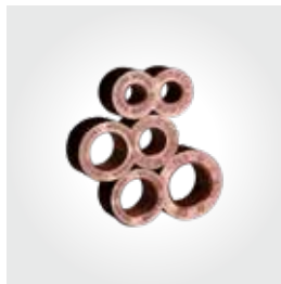
8 Figure 8 compression ground rod tap connectors