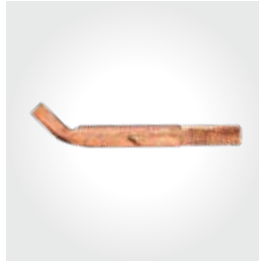
4 Structural grounding studs