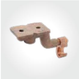
3 Ground plates