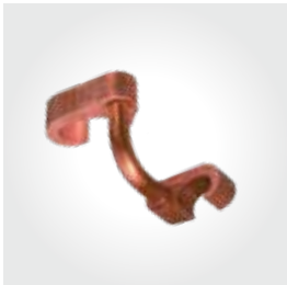
5 Figure 6 to 6 compression grid and ground rod connectors