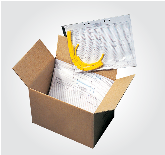
Cat. no. MUA

Unsorted in a loop in sequential manner based on how markers are on customer Excel file.