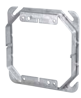
52 C 52 1/2 to 52 C 54 2