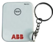
Remote test control