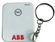
Remote test control