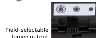
Field-selectable lumen output