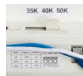
Field-selectable colour temperature