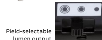
Field-selectable lumen output