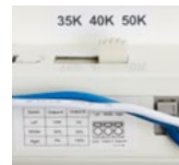
Field-selectable colour temperature