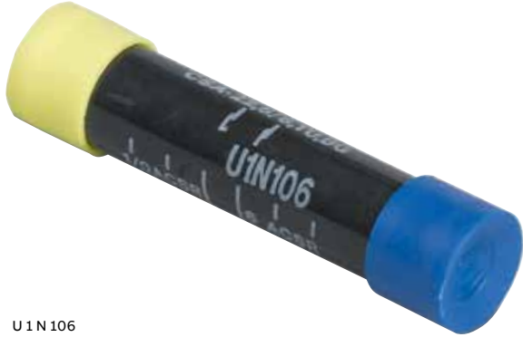
U 1 N 106

Insulated aluminum service entrance compression splices – U 1 N \frac{5}{8} " die series (longer length, 3\frac{1}{4} " long)