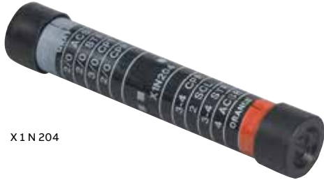
X 1 N 204

Insulated aluminum service entrance compression splices – 840 die series