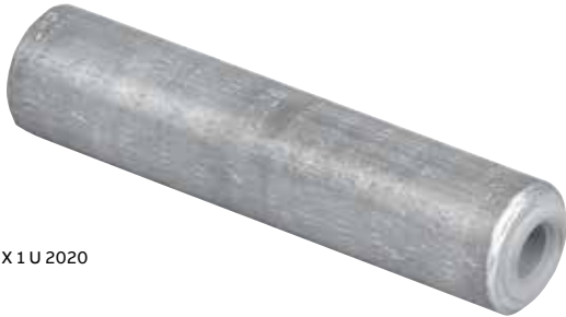
X 1 U 2020

Uninsulated aluminum service entrance compression splices – 840 die series