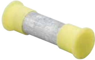
U 1 B 1010

Aluminum service entrance compression splices – U 1 B™ and CS™ 5/8" die series