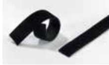
FOS series strip ties are pre-cut which makes bundling easy.