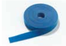
FOR series rolled hook and loop allows customers to conveniently cut pieces to desired lengths, eliminating waste.