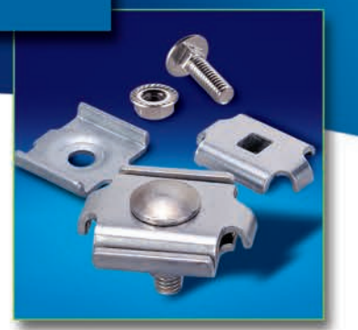
Connect and configure with a wide range of splices and hardware.