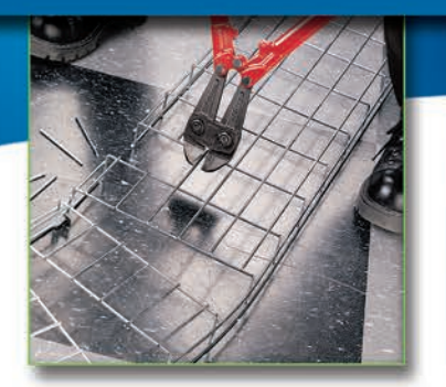
Customize any layout with a length of tray and a pair of wire cutters.