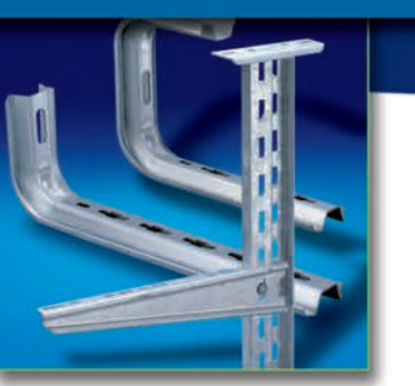
Mount tray to walls, floors, racks and cabinets.