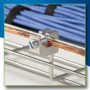
ETG lay-in ground lug installs easily with no disassembly required.

The ExpressTray <sup>®</sup> wire basket product line is a complete system that allows you to configure bends, tees, crosses, reductions/expansions and drop outs simply and efficiently. It includes: