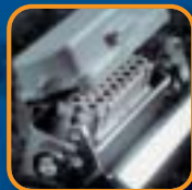
Pin & Sleeve Connectors