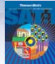
Product Application and Tooling

Meeting and exceeding customers' expectations is a fundamental goal of Thomas & Betts. Call the Technical Services Department and talk LIVE to an experienced technical representative who'll answer questions and concerns regarding all aspects of our products and services. We also offers a variety of on-line, self-service resources to make selecting and using our products as easy as possible.