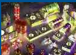
Color-Keyed® Power Connectors