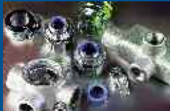
T&B Rigid Fittings