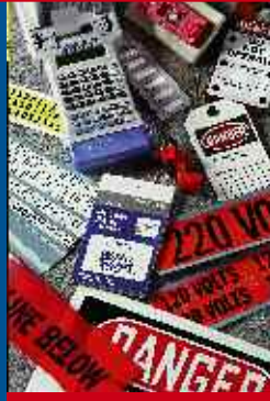
E-Z-Code® Identification Solutions