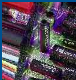
Shrink-Kon® Heat Shrink Products