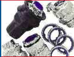
T&B Liquidtight Fittings