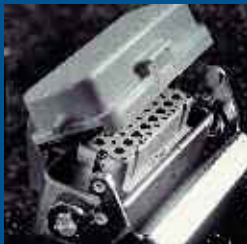
Pos-E-Kon® Rectangular Connectors