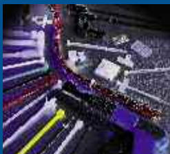
Ty-Rap® Fastening Products