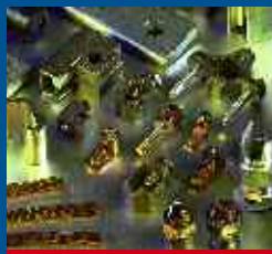
Blackburn® Mechanical Lugs