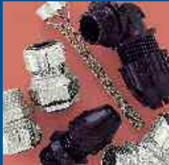
T&B Liquidtight Cord Fittings