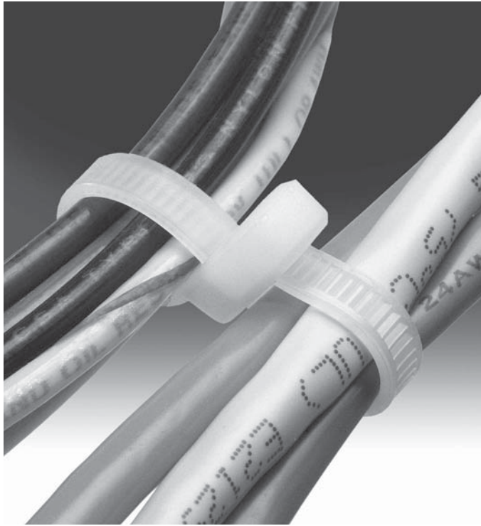
Double Loop ties allow the parallel routing of two bundles of cable with one single tie. Available in 3 different lengths.