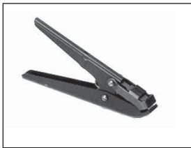
Cable Tie Tensioner