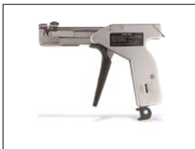
Tie-It Tool DAS250

These reusable cable ties are made from high-strength, corrosion-resistant 200/300 series stainless steel, coated with a non-toxic, halogen-free, low-smoke Nylon 11.