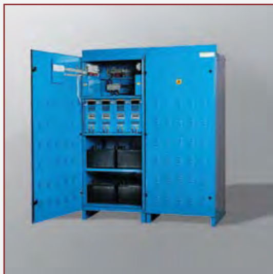
For all fluorescent/incandescent/LED loads

Interruptible emergency lighting inverter system 3KVA –15KVA