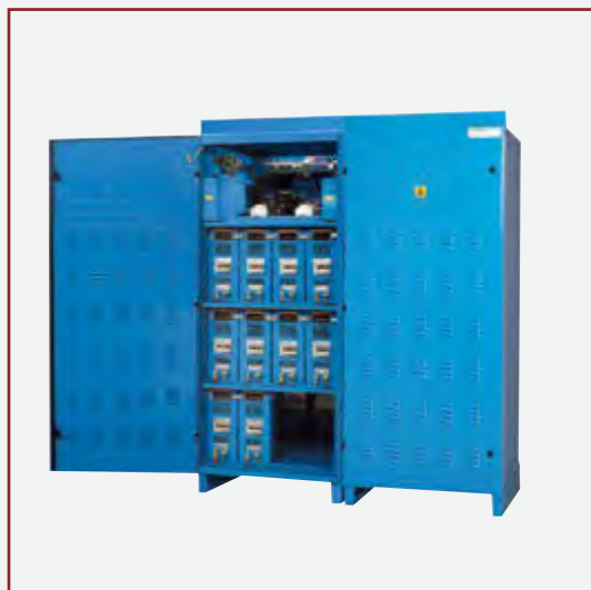
For all fluorescent/incandescent/LED loads

Interruptible emergency lighting inverter system 4.5KVA –54KVA